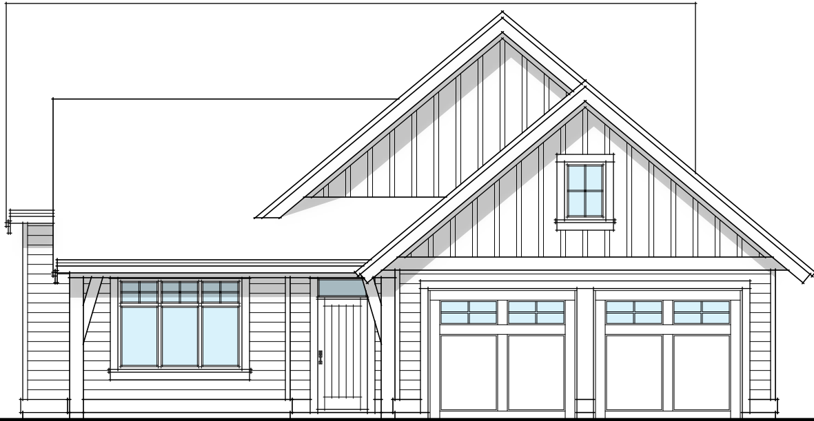
South Elevation (Rear)