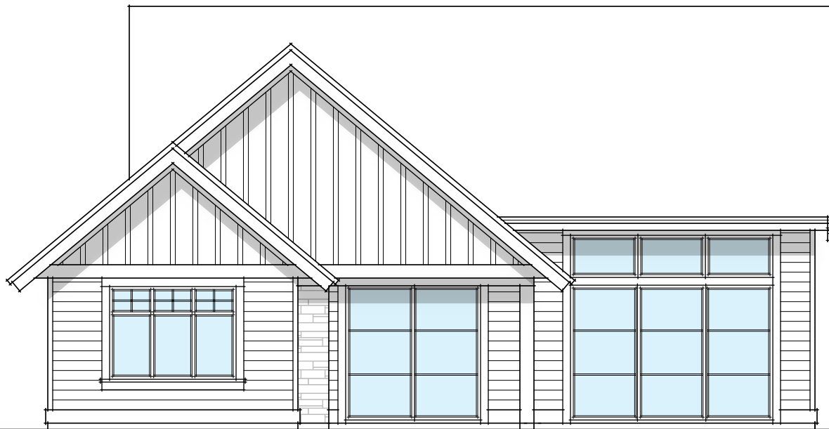
North Elevation (Front)